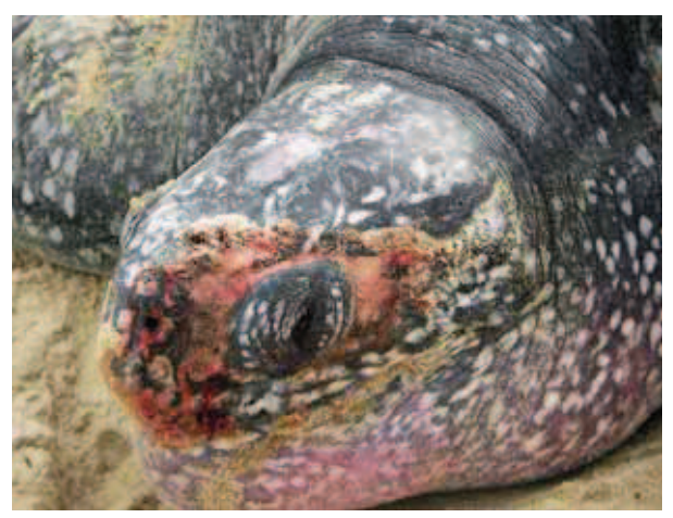
Fig. 4.- Female showing injuries in the head due to the oxidized metal rings.