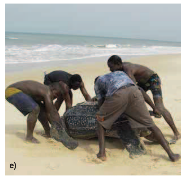
Fig. 3.- (c, d, e) Rescue operations: sequence of the release of a female that was trapped among the logs.