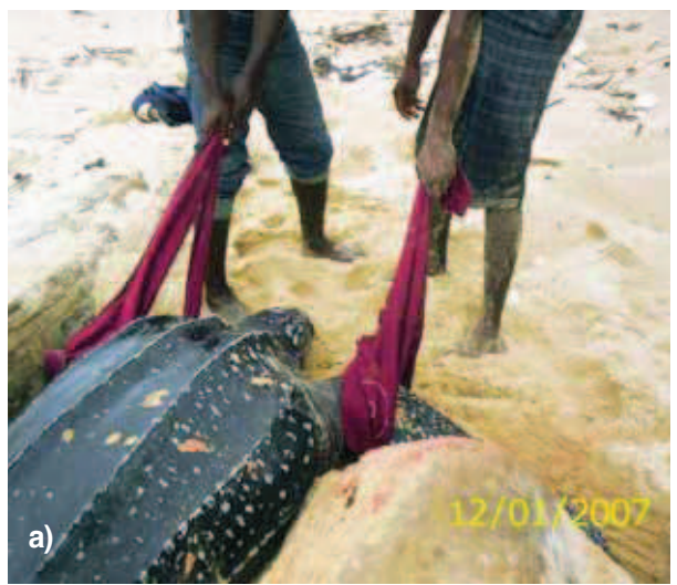
Fig. 3.- (a, b) Rescue operations: the technique of passing harnesses or pulling from below the armpits.

of season 2006/2007. These were sometimes complicated, due to the weight of the female and the position in which the female was usually found. The best technique to release the female, was by passing harnesses below the armpit; two people pulled the female this way, while a 3<sup>rd</sup> or 4<sup>th</sup> person would push forward from the back (Figure 3). The female should not be pulled by the caudal projection, as this is a very fragile part of the body. Sometimes females had to be pushed until they reached the sea, because they were already very debilitated and not able to crawl on the sand. However, the contact with seawater seemed to reanimate them as they instantly started to swim offshore. Some females, would also get injured by the logs (Figure 4), as these have oxidized metal rings attached. We were able to identify such scars in the head, flippers and carapace of several nesting females.