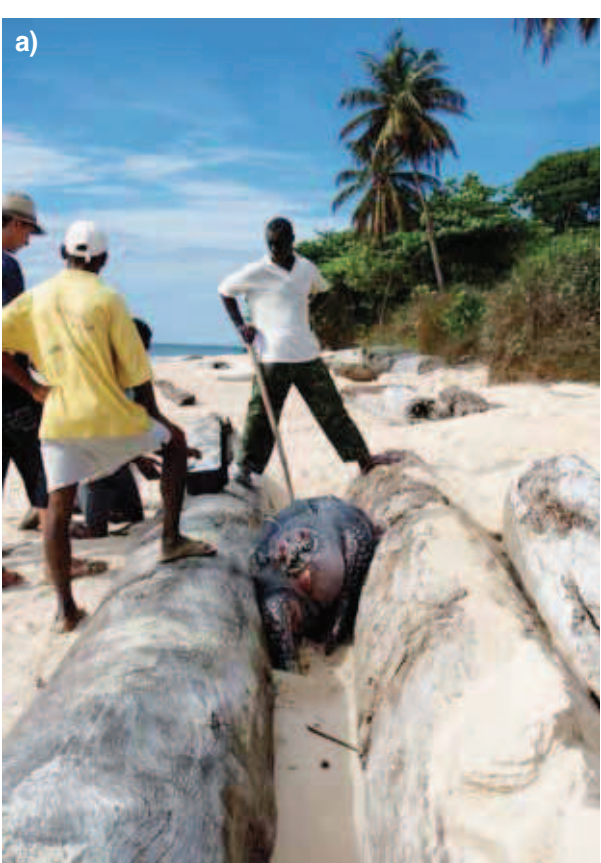
Fig. 2.- (a, b, c, d) Dead females among stranded logs.

The research was carried out at the beach of Kingere in Pongara National Park (0°18 N, 9°18 E; Fig.1) during 3 consecutive seasons (2005/2008). The nesting season for the leatherback in Gabon spreads from November to march, with a peak of activity during December and January. Local NGO Gabon Environnement provided logistic support at a beach-based research camp. Basic monitoring activities included night patrols for female identification and in situ nest marking as well as early morning track counts. These were carried out by local guards of the NGO and the National Park that had been specifically trained in marine turtle manipulation techniques.