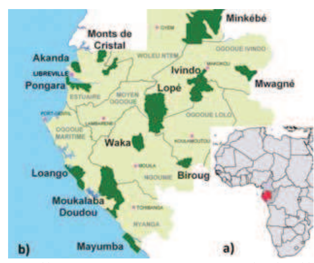
Fig. 1.- (a) Location of the country of Gabon in Central Africa (in red) and (b) the 13 National Parks in Gabon, including Pongara, the study site.

Along with the Guianas, the Republic of Gabon (Central Africa) hosts the largest nesting aggregation in the world for the leatherback turtle Dermochelys coriacea (Vandelli, 1761) (WITT et al. , 2009), yet there is still a paucity of detailed knowledge of many key aspects about reproductive ecology at the site (FRETEY et al. , 2007). Pongara National Park is one of the main protected areas along the coast. The beach of Kingere, with an estimated 170 to 450 nests per kilometer, remains almost virgin and can be considered as a hotspot for this species in Gabon (IKARAN, 2010). From 2005 to 2008, a study on the nesting ecology of D. coriacea was conducted at Kingere so as to determine and quantify the main natural and/or anthropogenic threats to the species at the different life-stages.