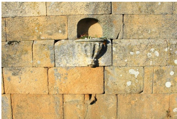
Outdoor of South sacristy where we can see a tank for indoor sink. Original and lovely stonework.