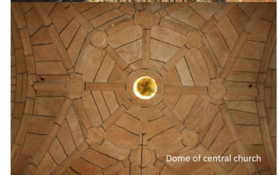
Dome of central church