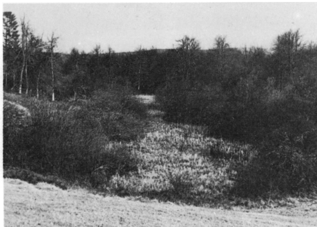
Photograph 1.- Marsh at «Alto de Altube», spawning site of Rana dalmatina (photo 4-III-1982).