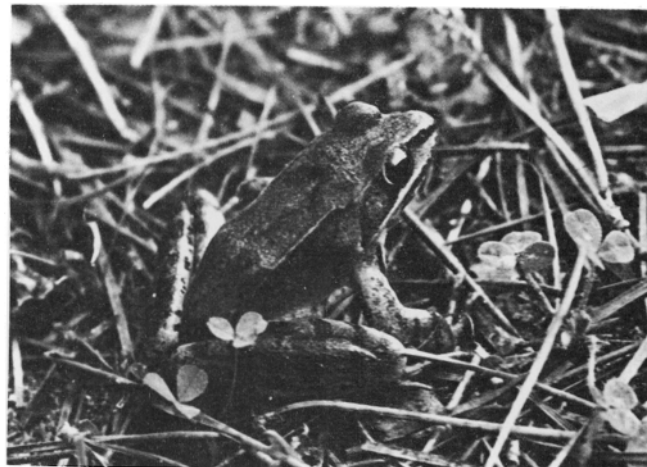
Photograph 2.- Rana dahatina specimen from «Alto de Altube» on 4-III-1982.

Spain (Veenstra in prep.; see also Dubois, 1982) but all other characters indicate Rana dalmatina . From Rana Iberica Boulenger, 1879 they are also distinct (size, colouration, habitat).