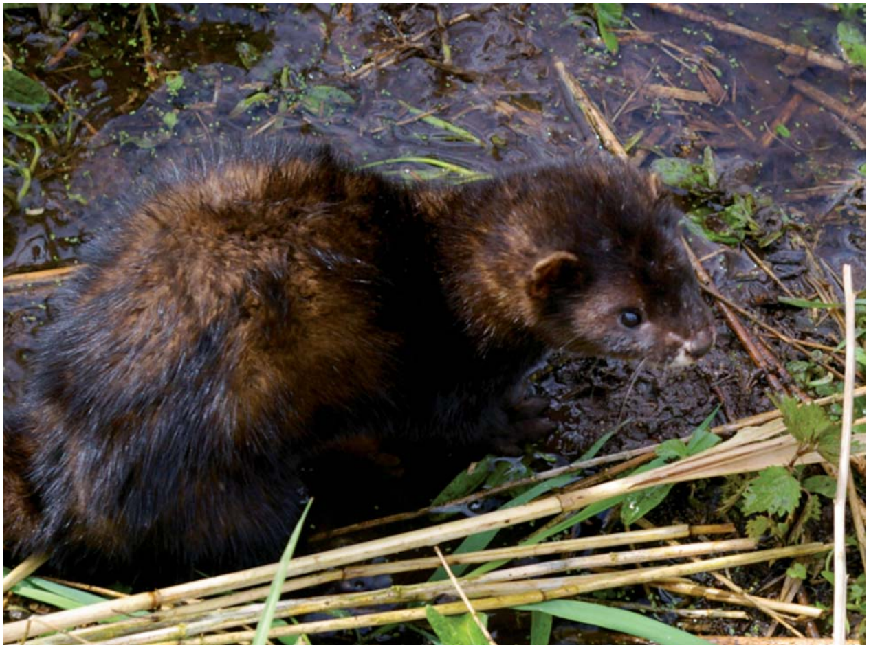
Fig. 2. - The dark polecat is characterized by an absence of facial mask.